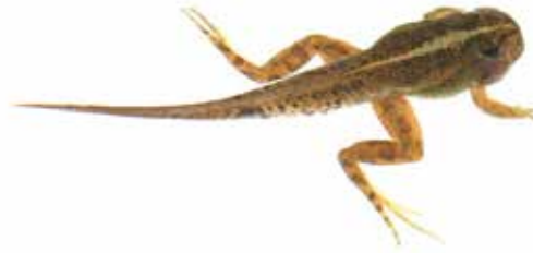
Tadpole with legs